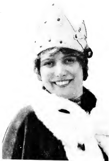
FAY LANPHIER AS MISS AMERICA 1925

O ut of many flattering compliments we have space for only a few. The first from a good judge, one of the leading wholesale florists of San Francisco;